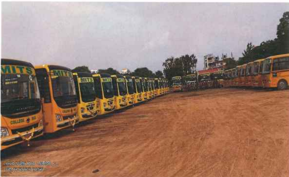
vivo V25 Pro - Narresh Dec 8, 2023, 11:58