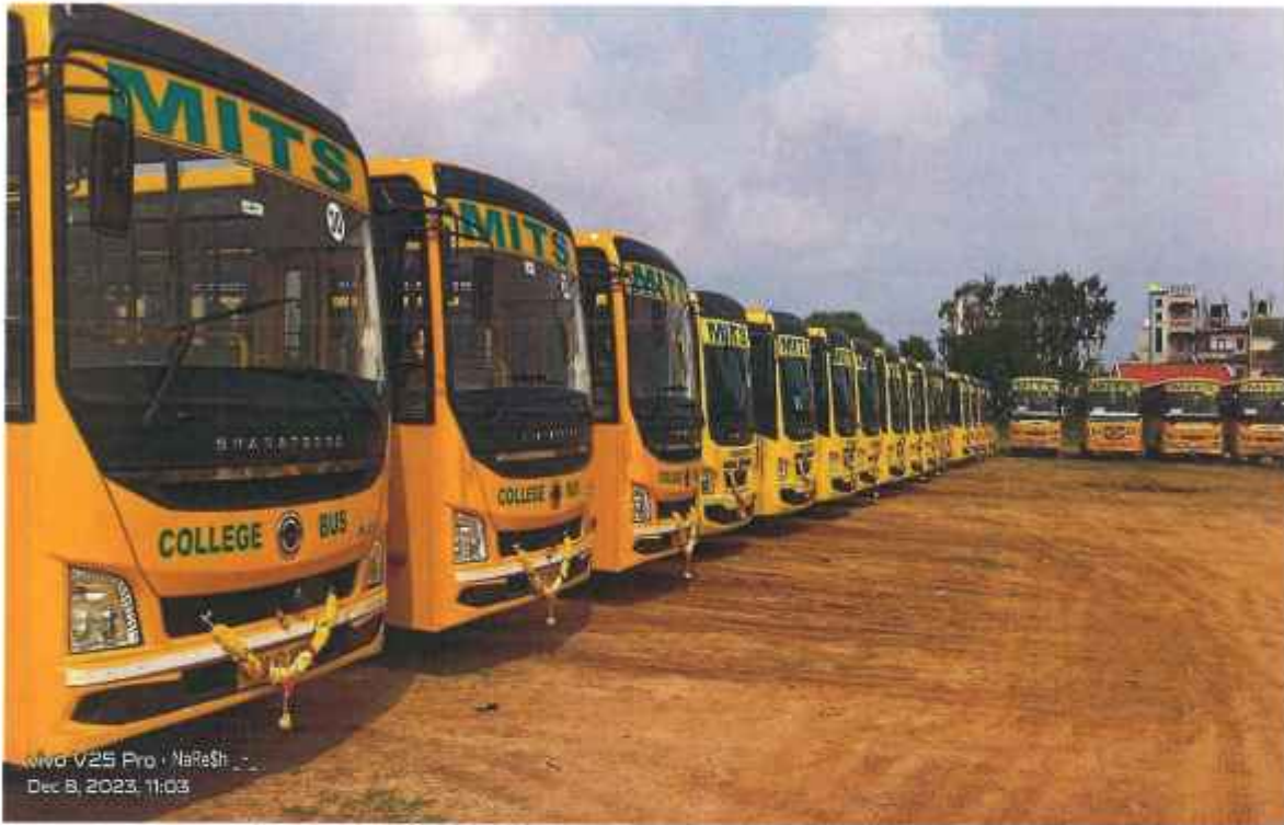
vivo V25 Pro - Narresh Dec 8, 2023, 11:03

Bus services to students and staffs to reduce the car and other transport mode to the MITS campus.